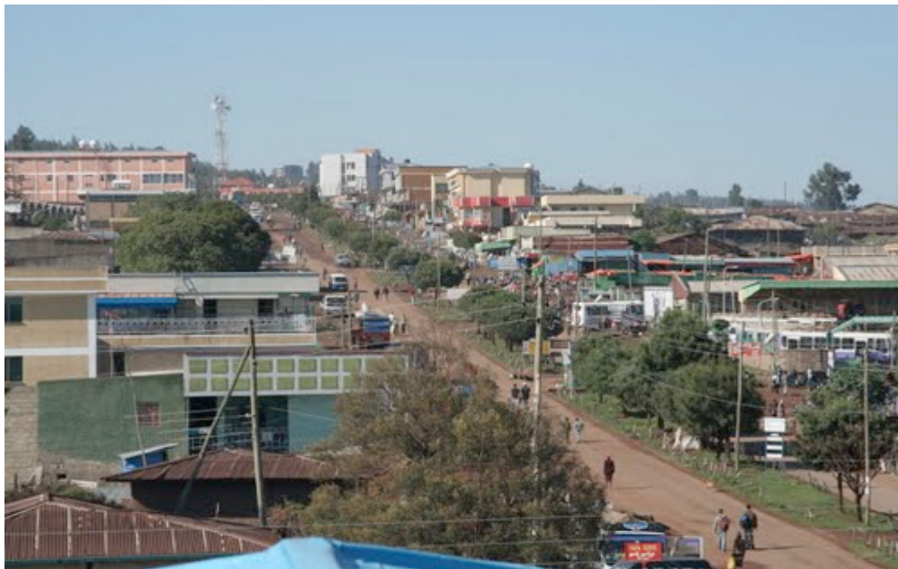
Figure 2. Assella Town