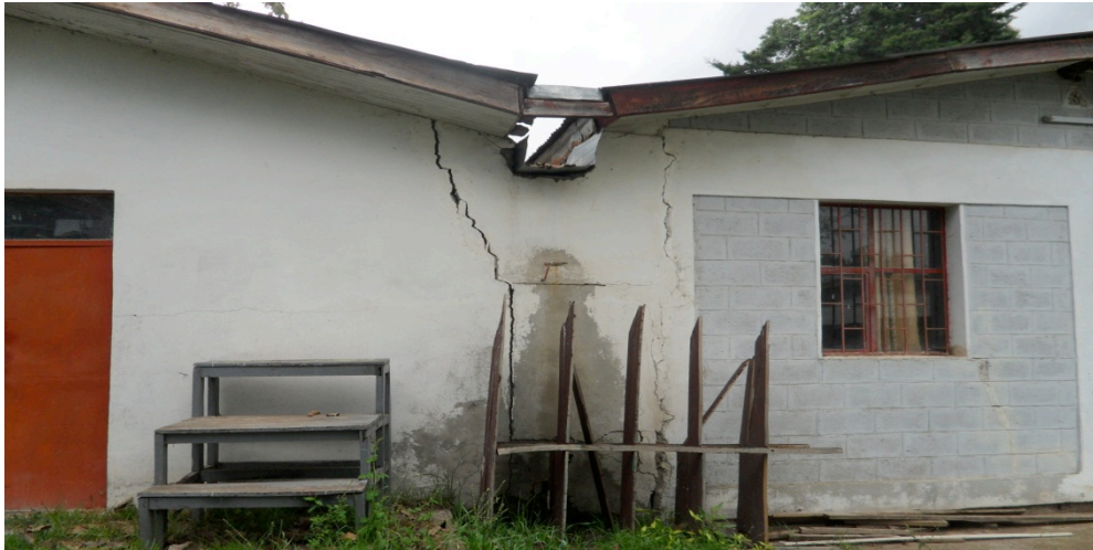
Figure 3. Broken walls of Assella fistula center

Taking into account these recommendations we collected quotes from different bidders and finally chose Adwa construction to carry-out the planned as well as the additional (roof and broken walls) renovations.