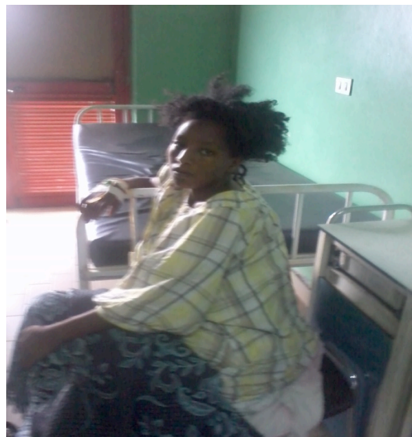
Figure 4. Fistula patient treated at Assella fistula center

The poorest and the most vulnerable woman was selected for reintegration. The project has identified this young girl who had contracted obstetric fistula during her first delivery 2 years back, and who had consequently been rejected by both her husband and her parents. As she has been in a state of depression, with no social ties, nowhere to go and no plans for the future, the coordinator at Assella hospital has been put in charge of identifying income generating activities that would enable her to work within the perimeters of the hospital during the day (by, for instance, selling fruits and soft drinks to other patients) and attend school during the evening. Details on the progress of the reintegration activities will be reported in the next quarterly report, and the photo of the girl is shown below.